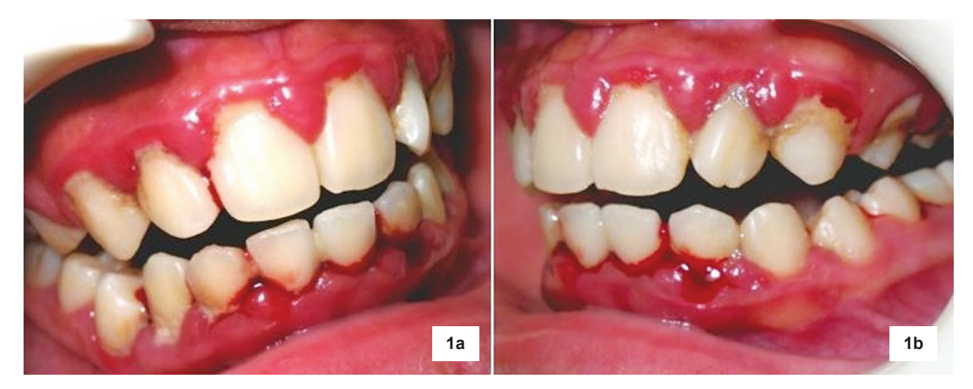
Figures 1a and 1b. Patient's initial oral examination revealed severe bleeding of the gums and heavy calcular deposits.