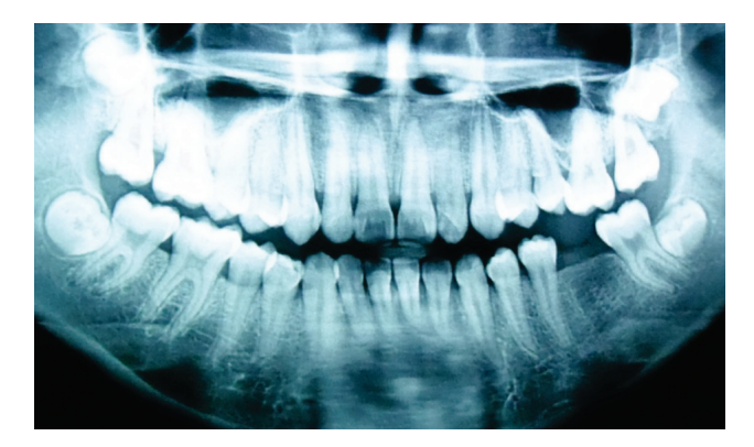
Figure 5. Panoramic x-ray showing no caries and no obvious bone loss.

On follow-up after 20 months, a panoramic x-ray (Figure 5) did not show any significant bone destruction around the teeth. The following serological tests were requested: glycated hemoglobin assay (HbA1c), fructosamine test (a measure of glycemic control over the previous 2-3 weeks), and high sensitive C-Reactive Protein (hsCRP).<sup>15</sup> HbA1c was determined using high performance liquid chromatography