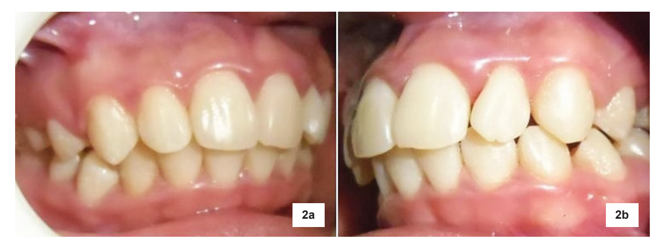
Figures 2a and 2b. Gum bleeding was significantly reduced after only 4 sessions of scaling but the traces of inflammation can still be seen on the marginal gingival and interdental papilla.

but dental caries and tooth mobility were not observed. The patient was aware of her bleeding gums but denied knowing she had bad breath. She brushes her teeth three times a day and uses dental floss once a day. Initial treatment consisted of scaling and tooth polishing for 4 visits to reduce gingival bleeding and remove gross calculus deposits (Figures 2a, 2b), and to educate the patient on proper oral hygiene practices. During these visits, lessons learned from past diabetes camps she attended like: calorie counting, food exchange, insulin adjustment, injection techniques, blood glucose monitoring and other topics on diabetes self-management were reviewed. The patient was unable to return for further treatment until 20 months later.