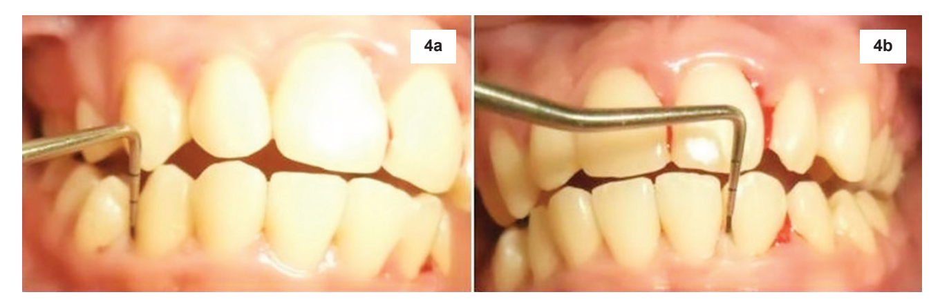
Figures 4a and 4b. Marked resolution of inflammation on the interdental papilla areas. Gingival bleeding was markedly reduced but gingival margin still appears swollen.

Serologically, there was a decrease (~20%) in fructosamine levels (from ~362 umol/L to ~289 umol/L) 1 month following periodontal therapy, which remained relatively constant. HbA1c levels increased (from 9.1% to 9.8) three months from the time of the initial visit while hsCRP levels also slightly increased from 0.13 mg/dL to 0.15 mg/dL over this time.