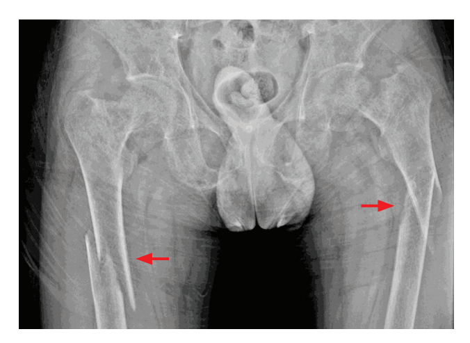
Figure 2. Frontal radiograph of both upper femurs shows badly displaced fractures of both upper femoral shafts ( red arrows ). These pathological fractures have occurred through bilateral underlying osteolytic lesions consistent with brown tumors.

To further localize the parathyroid adenoma, a computed tomography (CT) scan with intravenous contrast was performed on the neck and chest (Figure 4) which showed an avidly enhancing soft tissue nodule in the aortopulmonary window/anterior left mediastinum region