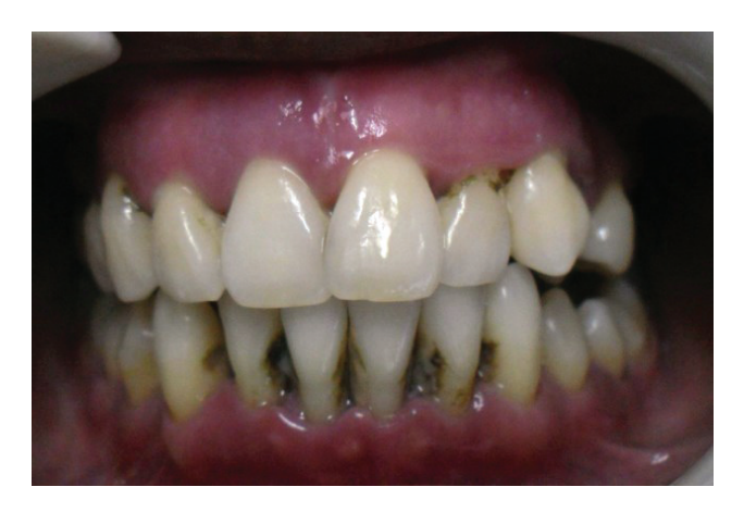
Figure 1. Patient's initial appearance, March 3, 2012.

when no mobility was detected, 1 when there was less than a millimeter (mm) of mobility detected, 2 when there was a >1 mm mobility detected (Table 1). Caries or tooth decay was found on the following teeth: 15, 26, 27, 36, 46, and 47. Tooth numbers 18 and 28 were impacted. Tooth numbers 13 and 37 had periodontal pockets less than 6 mm while all remaining teeth had pockets greater than 6 mm (Table 1). Except for tooth numbers 47, 46, 36, and 37, all the other teeth had 50% or less remaining bone support based on the panoramic x-ray (Figure 4).