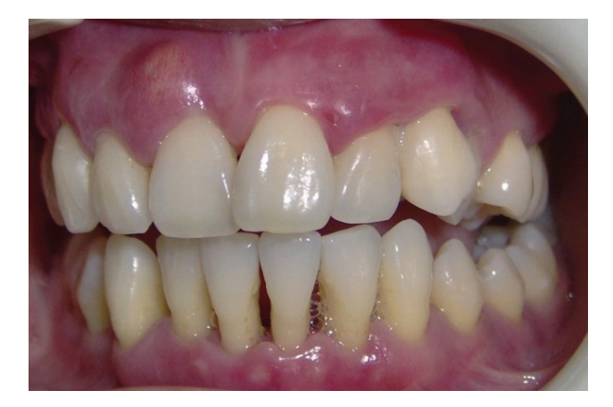
Figure 2. After 3 rounds of scaling.