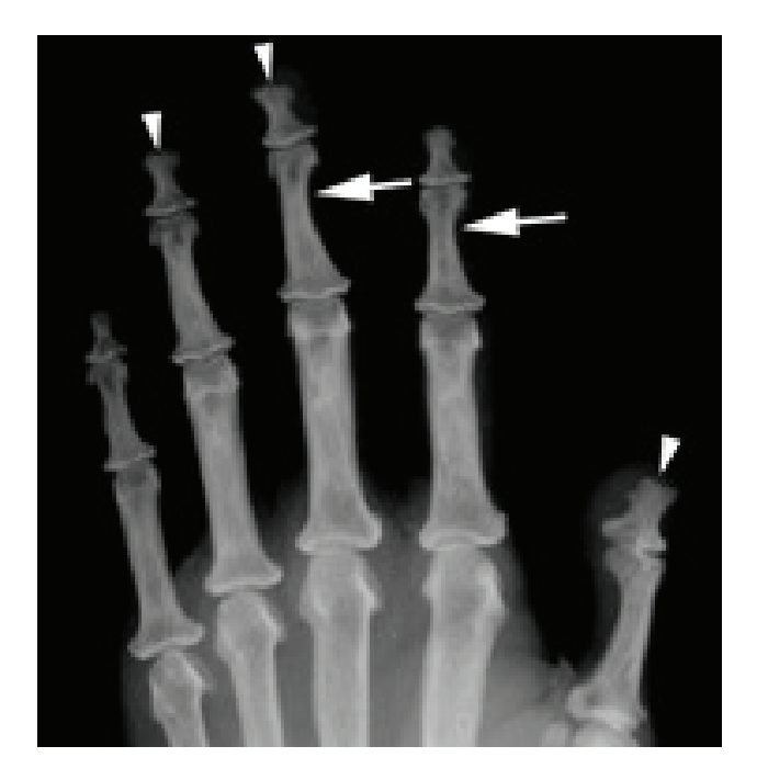
Figure 1. AP radiograph of the left hand, cropped to accentuate osseous detail. Areas of subperiosteal resorption are seen markedly at the radial aspect of the third middle phalanx, and subtly at the radial aspect of the second middle phalanx ( arrows ). Acro-osteolysis is also evident at the distal phalanges ( arrowheads ).

At the time when the patient was diagnosed with PHPT, sodium dihydrogen phosphate was the medical treatment for persistent hypercalcemia. Subsequently, cinacalcet was added when it became available. Unfortunately, she experienced adverse adverse effects from cinacalcet: persistence of poor appetite, nausea and vomiting led discontinuation of the drug for one month. When cinacalcet was reinitiated, the dose was titrated upward gradually to the optimal dosage of 25 mg twice daily without severe adverse gastrointestinal effects. Ergocalciferol (vitamin D2), at a dosage of 0.25 \mu g daily (titrated based on the calcium level) was also started for her subnormal serum 25(OH)D level.