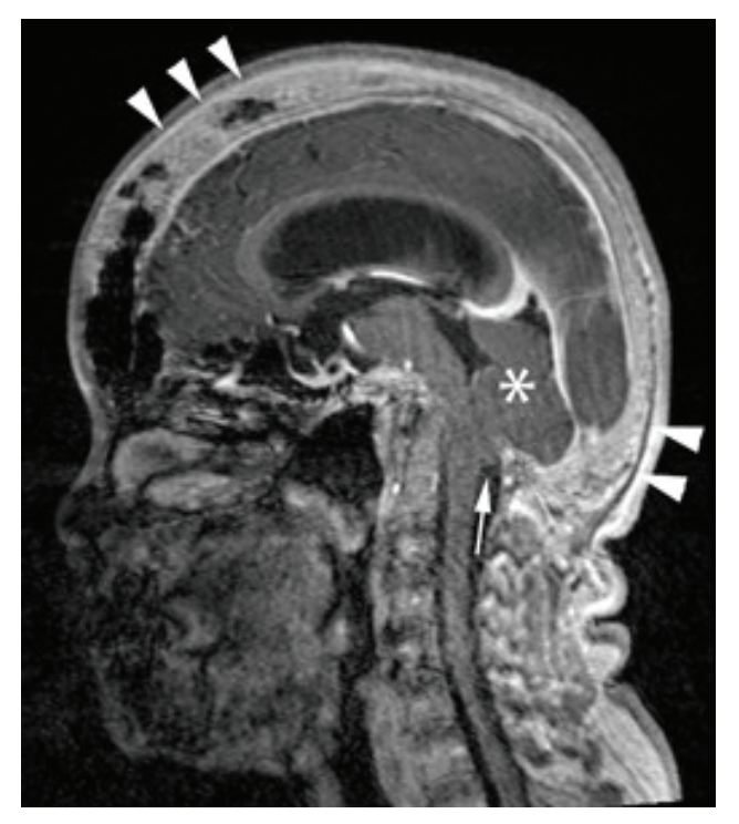
Figure 3. T1 post-gadolinium MRI in midsagittal reconstruction. Calvarial thickening, a known effect of hyperparathyroidism, is apparent (arrowheads) . Note the ventricular dilatation and the small posterior fossa (asterisk) . Cerebellar tonsillar herniation is depicted (arrow) .

Figure 2. Cross-sectional CT of the mandible in bone algorithm at the level of the mandibular angles (A) and symphysis menti (B). There is a loss of cortical and marrow differentiation. This has been replaced by a ground glass density, with areas of irregular osseous expansion ( arrowheads in A ) and patchy regions of osteosclerosis ( asterisk in A ). Cystic lesions with well-circumscribed sclerotic margins ( arrows in B ) are likely Brown tumours, with evident dental displacement.